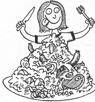
a substantial meal