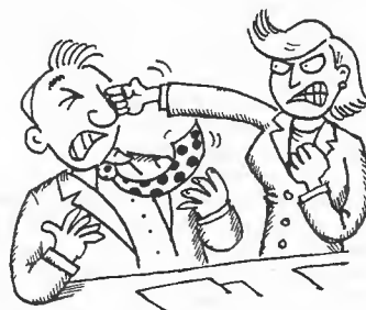
making a point