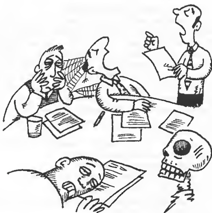
debating at length

If you don't spend much time on an issue, you touch on the issue . If you pay a lot of attention to an issue you: