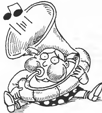
My sister has taken up the tuba.