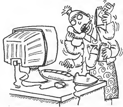
operating at full capacity

an advertising campaign an initiative an operation a product a programme a project a scheme a takeover bid