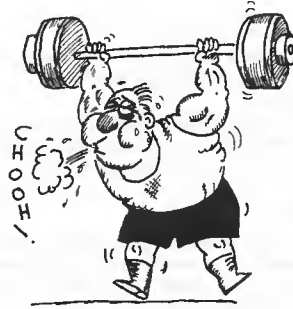
a heavy cold