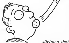
slicing a shot