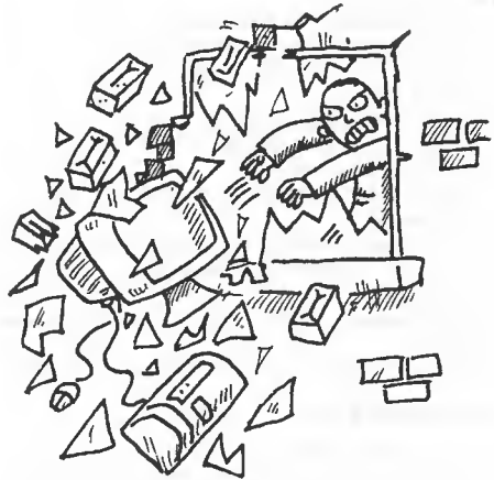
resizing a window