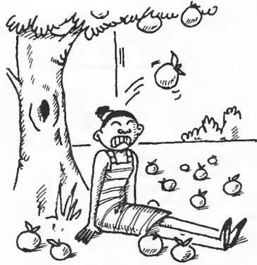
a bumper crop of apples

Pineapples grow in tropical climates. We have been growing redcurrants for many years. Blackberries ripen in the autumn. We haven't had any pears yet this year. This tree produces very sweet plums. She picked a ripe apricot and started to eat it. Growers are expecting a bumper apple harvest this year. a bumper apple crop/crop of apples He's a peach grower .