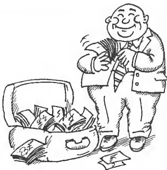
making a fat profit

capital cash demand employment income profit publicity revenue